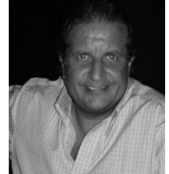
---- Bariloche Arrival