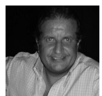
---- Bariloche Arrival